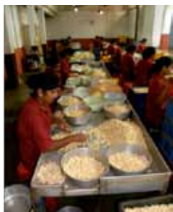
Zantye Cashew Factory: A Supplier of Organic Cashews from Goa

Cover for 1st half 2010 and cover a certain percentage for 2nd half 2010.